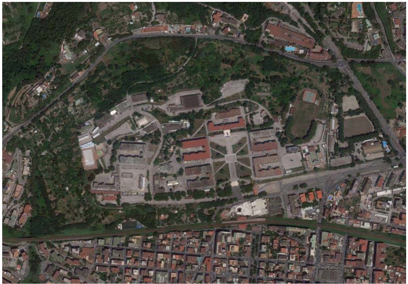
Figure 2. Satellite photo of Collegio Ciano and San Laise hill.

In fact, for its fourth centenary, The Banco di Napoli Foundation for Childcare (that is the owner of the land) built the Collegio as a model of hospitality and solidarity for the entire country, an open place for the city and the most needy. The area of about 20 hectares was organized like a real youth citadel with 18 buildings, schools, dormitories, infirmaries, logistic and sporting structures, a church, a theater, and it could host about 2500 boys and girls in need of hospitality (Figure 2).