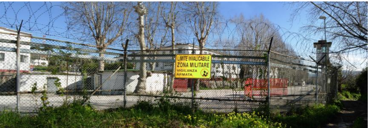
Figure 1. The barbed wire protecting the area is still visible today. The sign says: Military Security Zone. Entrance Forbidden.

During the 2013, the city administration and the landowners have signed an innovative public-public Memorandum of Understanding that presents times, terms and conditions for the construction of a general master plan defined by the NATO Urban Implementation Plan.