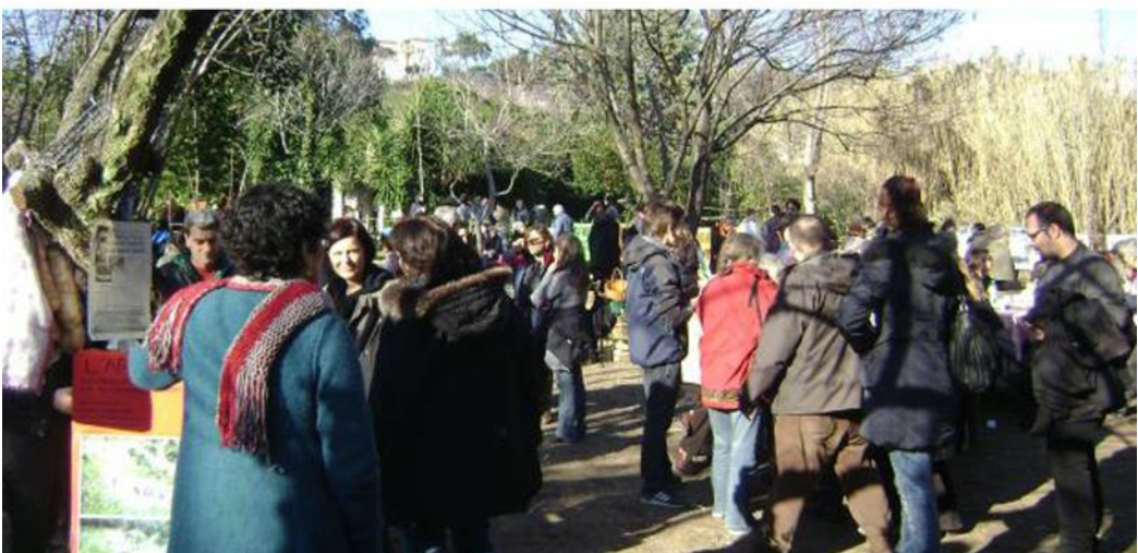
Figure 4 San Laise hill is agriculture, orchard, garden but also social relationships, entertainment, education, togetherness....