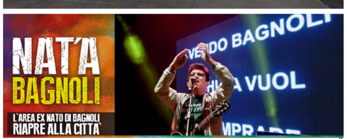
Figure 5. Yesterday there were the army, today the citizens. Break the lines and dance: on December the 1<sup>st</sup>, the "liberation" of the area was celebrated with a free public concert opened to all citizens.